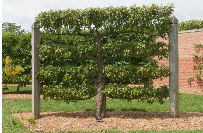
Espalier trees at Chicago Botanic Garden