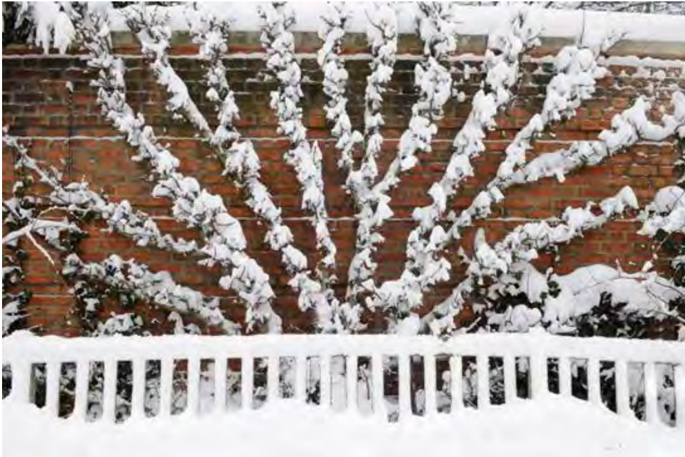
Espalier at Chicago Botanic Garden

Join us in these interesting events to come: