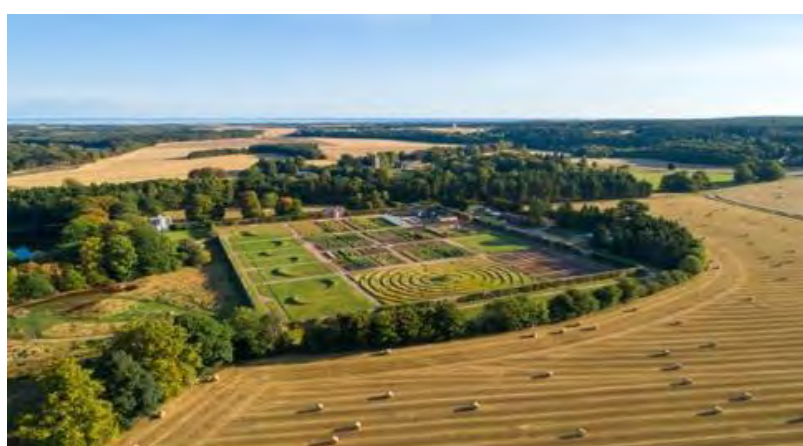
The Walled Garden at Gordon Castle

You receive this email because you participated in one of our (online) conferences. Our mailing address is: contact@potagershistoriqueshistorickitchengardens.eu Copyright © 2025 European symposium on the conservation of historic fruit and kitchen gardens. All rights reserved