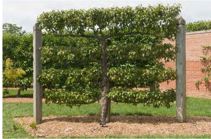
Espalier trees at Chicago Botanic Garden