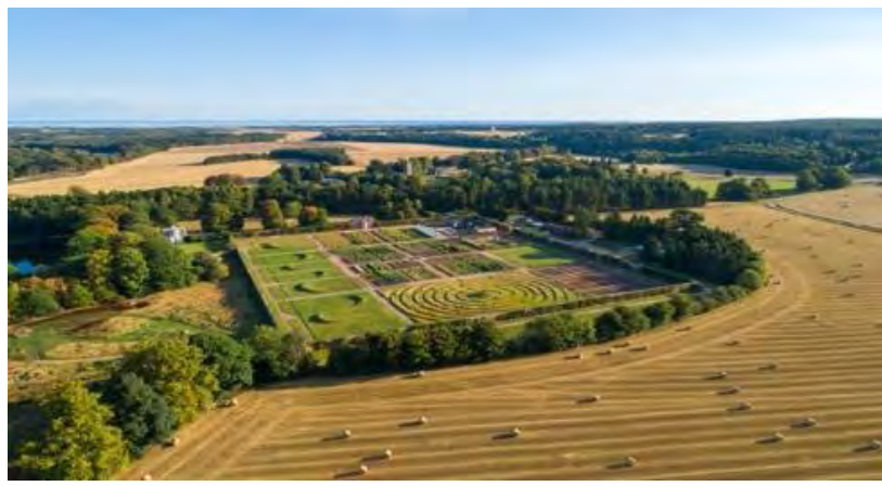
The Walled Garden at Gordon Castle

You receive this email because you participated in one of our (online) conferences. Our mailing address is: contact@potagershistoriqueshistorickitchengardens.eu Copyright © 2025 European symposium on the conservation of historic fruit and kitchen gardens. All rights reserved