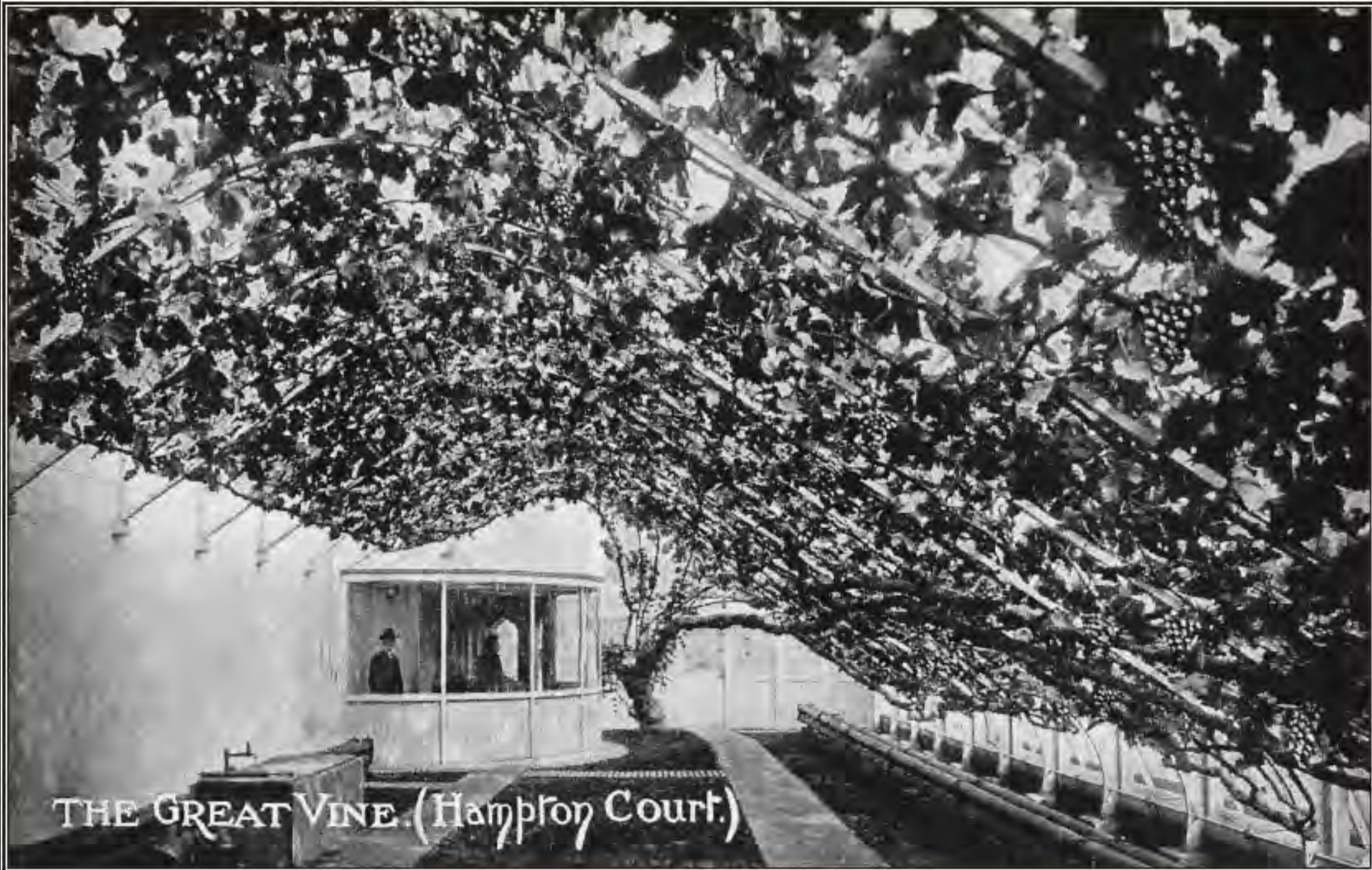
THE GREAT VINE. (Hampton Court.)