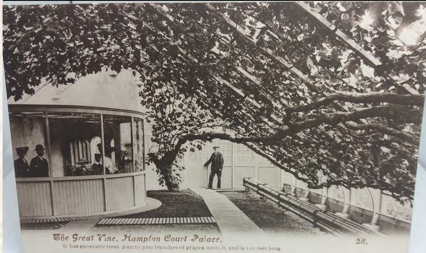
The Great Vine, Hampton Court Palace.

It has generally from 2000 to 3000 bunches of grapes upon it, and is 110 feet long.