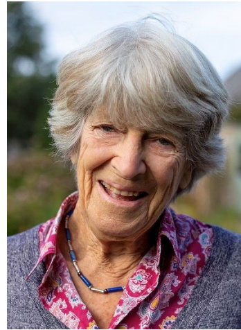
Susan Campbell's book finally translated into French