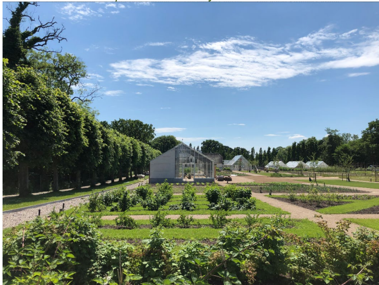
The Royal Kitchen Garden at Graasten Palace, Denmark

Two years after Chambord, and three months before we meet again at Culinary Estate Parc Broekhuizen in Leersum, the month of June 2024 will be special for the friends of the European Symposium on the conservation of fruit and kitchen gardens -