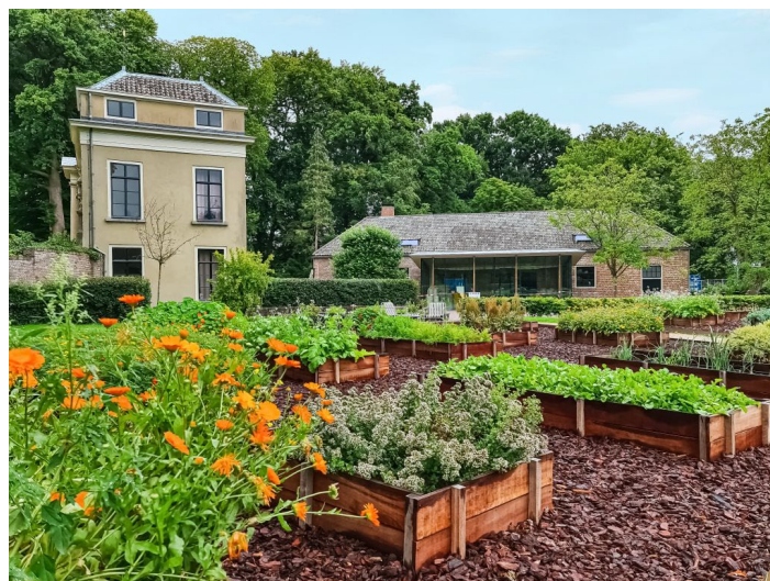
The kitchen garden at Culinary Estate Parc Broekhuizen ©Parc Broekhuizen.

For the full conference programme and the registration form go to: www.skbl.nl/the-second-european-symposium-on-the-conservation-of-historic-fruit-and-kitchen-gardens-en/