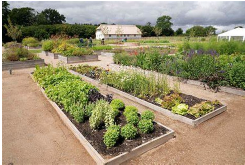
The Royal Kitchen Garden at Graasten Palace

learning about nature and the growing of food. Please register at amisdupotagerduroi@yahoo.fr to receive the link to this webinar.