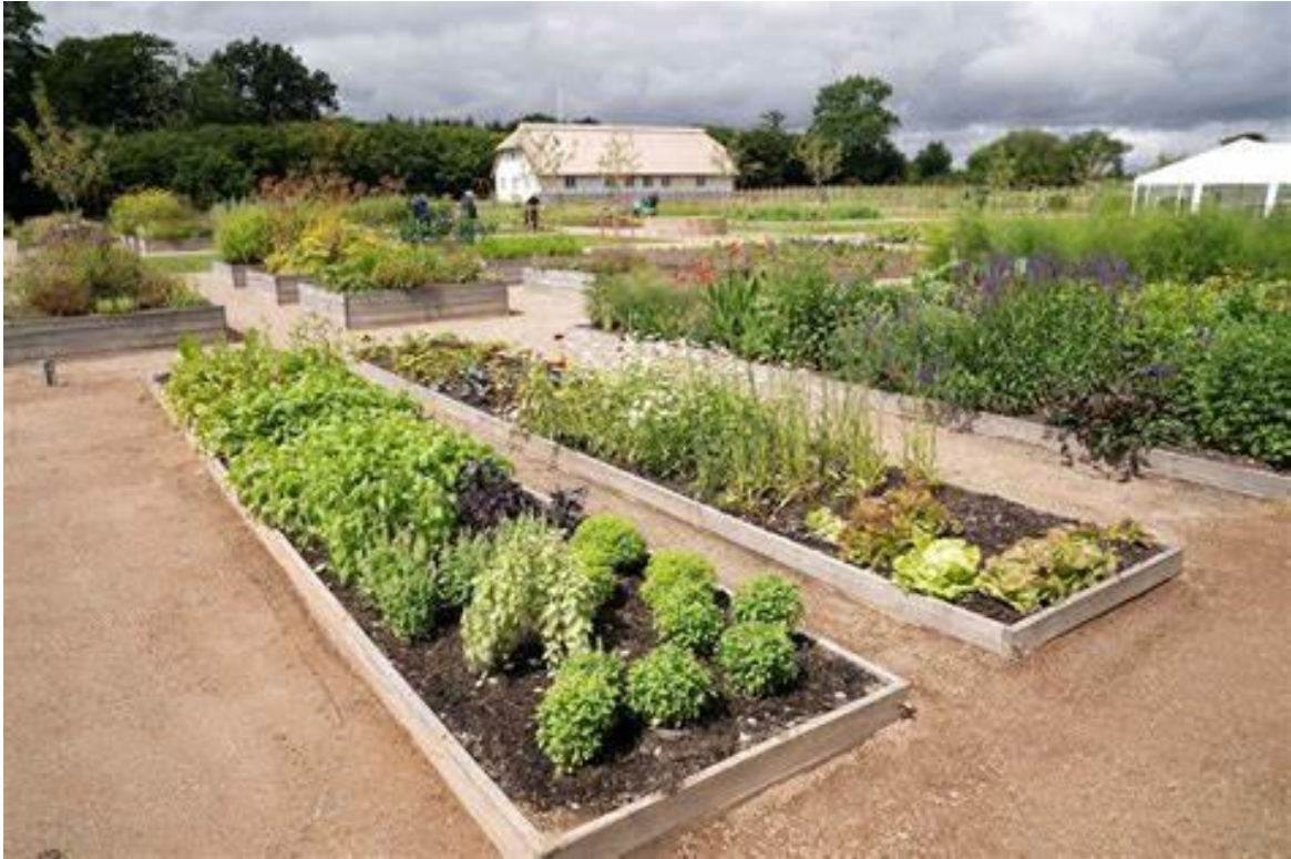
The Royal Kitchen Garden at Graasten Palace