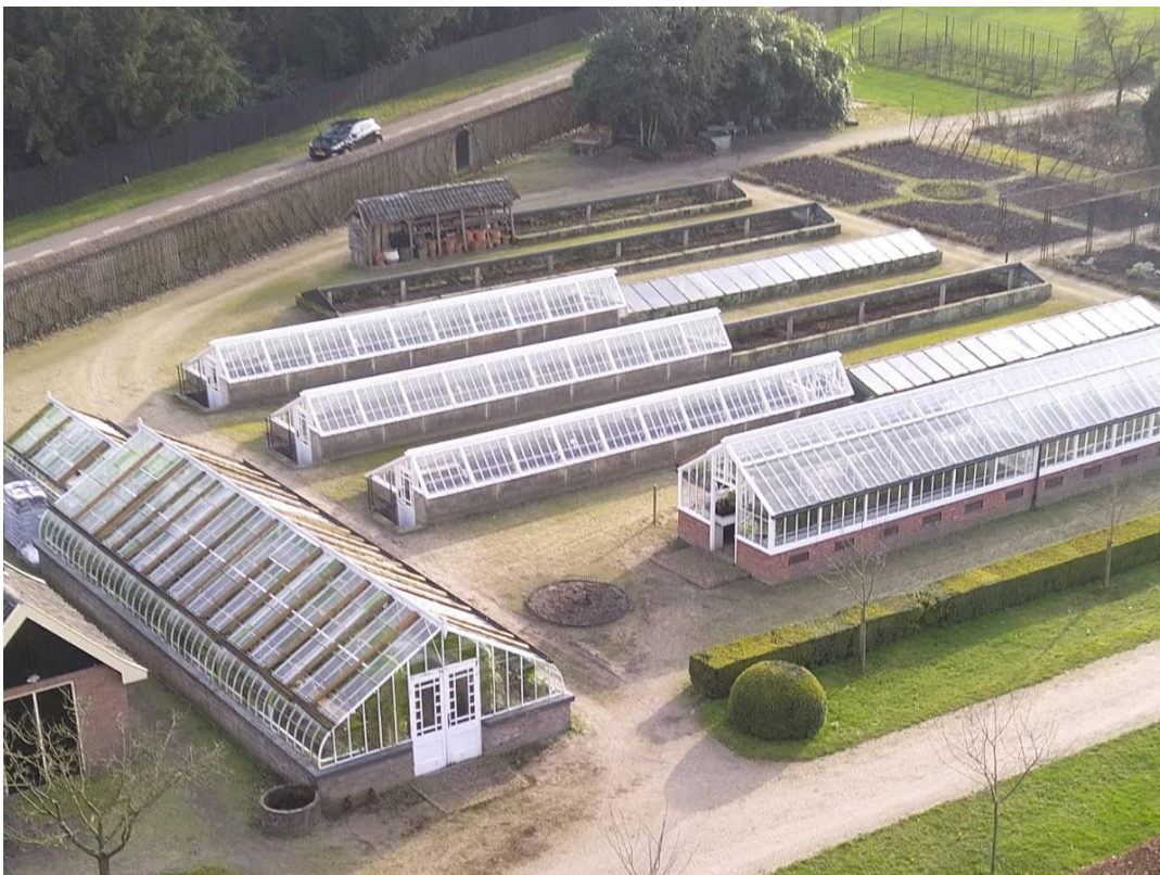
Glass houses and potting shed in the kitchen garden at Twickel estate

Please register at amisdupotagerduroi@yahoo.fr to receive the link to this webinar.