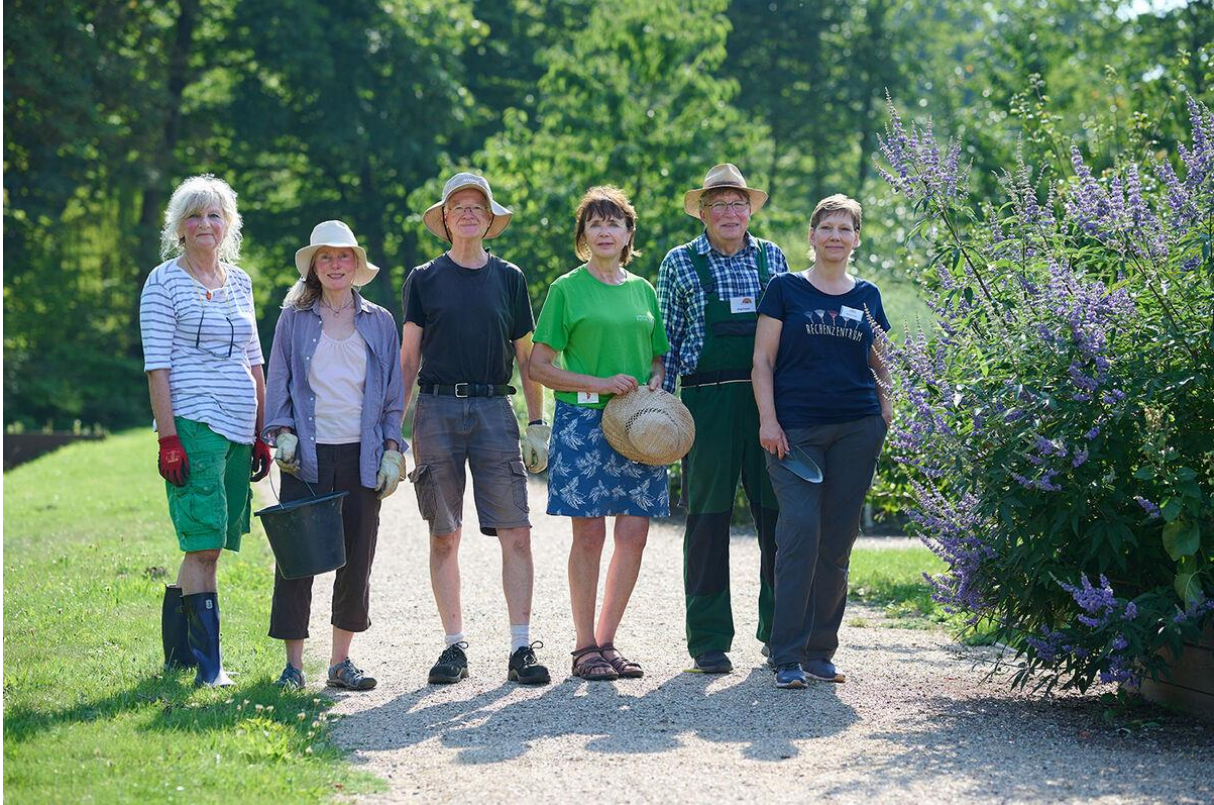
Volunteers at Eutin Castle (@Schloss Eutin)