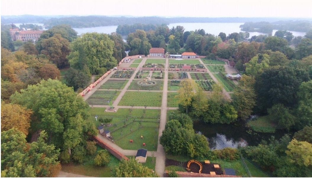
The kitchen garden at Eutin Castle, Germany