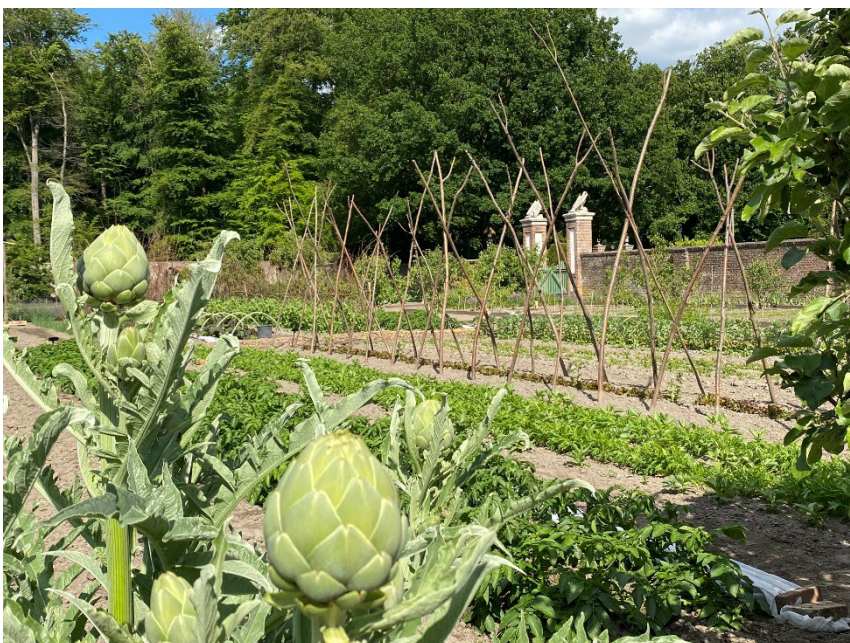
The kitchen garden at Zuylestein estate, Leersum

After Chambord, the second European Symposium on the conservation of historic fruit and kitchen gardens will take place in The Netherlands on Thursday 7th and Friday 8th September 2024. During the online conference on June 8 we will tell you more about this new event!