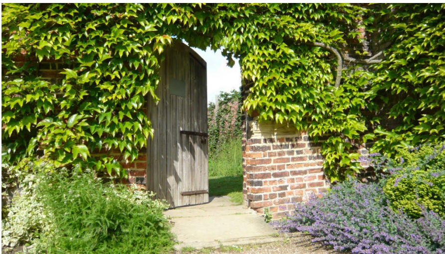
Kitchen garden at Harewood House